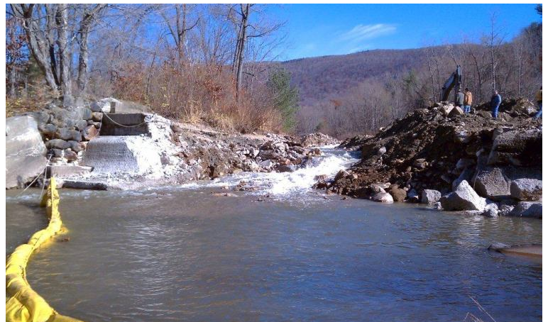
The river flows freely again.

(The Commonwealth of Massachusetts also announced in November 2010 that it would award $1,700 to the Hoosuck Chapter of Trout Unlimited, to produce final plans for the removal of the Thunder Brook dam in Cheshire, in the South Branch watershed of the Hoosic River.)