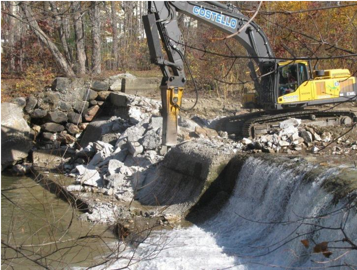
Demolition of Briggsville Dam begins.

The Briggsville Dam in Clarksburg was an obstacle to fish passage for more than a century. Long unused, a threat to flooding on local roads, and essentially non-reparable, it had become a liability for its owner, Cascade School Supplies. Now it is gone. The 15 foot tall, 145 foot long dam was first breached in November 2010. Removal was completed in December of last year. In months to come, nearby banks will be stabilized and planted and native in-stream and riparian habitat will be restored.