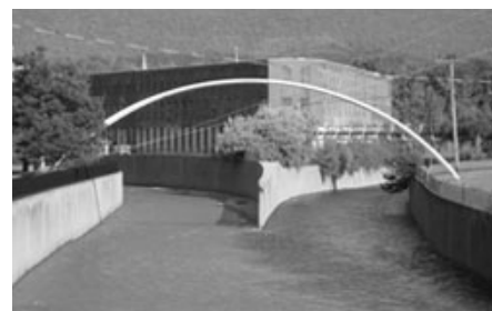
The Hoosic in North Adams.

Individuals can also download a copy of the brochure from the River Revival’s website: www.HoosicRiverRevival.org . On this recently updated website one can also find technical information on the flood chute design and the flow of the river, as well as some river restoration proposals for the Hoosic River. In addition, the website provides a summary of the Community Conversation held in North Adams last year, and photos of some of the many successful riverfront parks that have been created in other parts of the