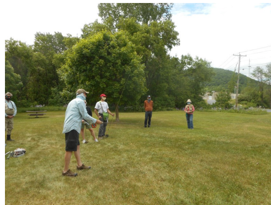
Fly fishing demonstration—2020

Co-presented with the Pownal Recreation Task Force. A recreational ride through our scenic watershed. Watch for details on our website.