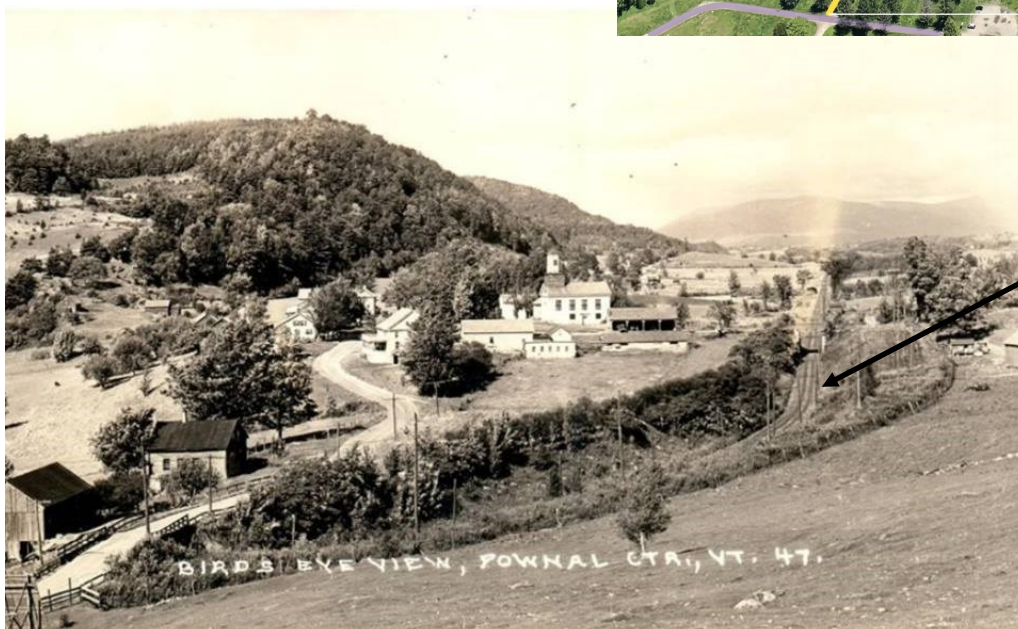
Pownal Trolley Line