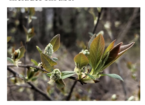
Black Cherry leaves and flower buds

Visit the HooRWA blog to review Bill Moomaw's recommended native tree species to plant to help mitigate against climate instability. And check out wildseedproject.net for their native trees list which includes shrubs.