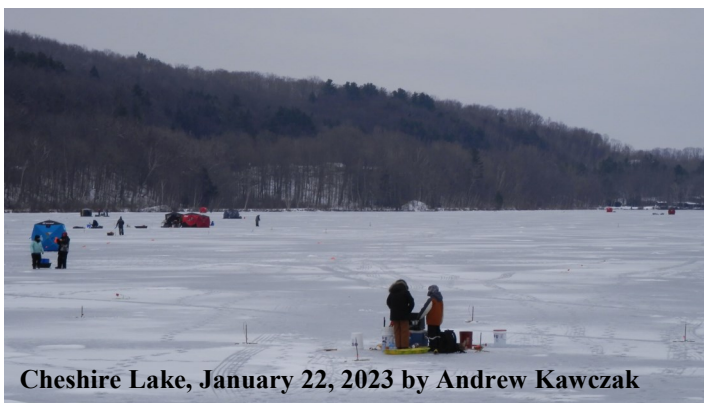
Cheshire Lake, January 22, 2023

Winter means ice fishing for many folks. Cheshire Lake, which is the headwaters of the South Branch of the Hoosic River, is a popular destination to enjoy this winter pastime.